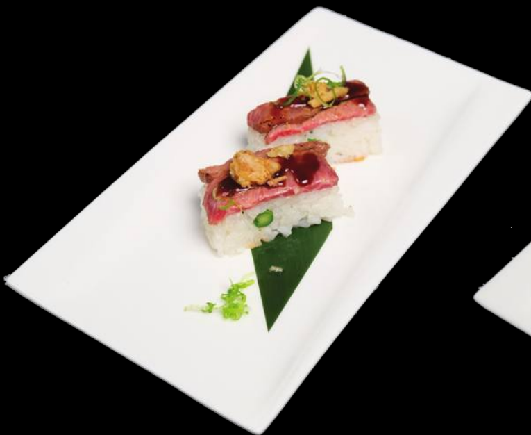
🍣 Wagyu Sushi