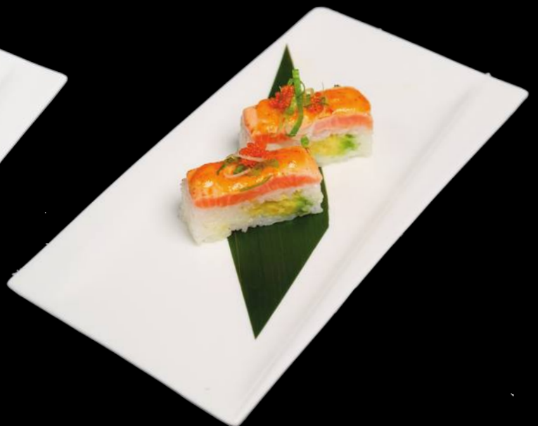
🍣 Salmon Torch Sushi